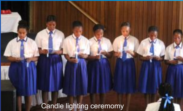
Candle lighting ceremony