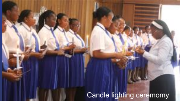
Candle lighting ceremony